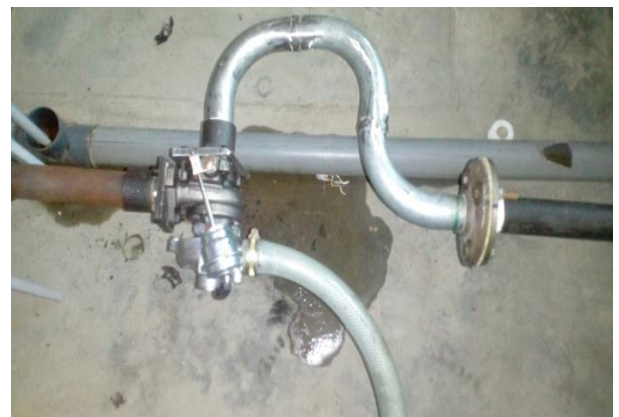
Figure1: Turbocharger with Engine Setup

A turbocharger is a device used to allow more power to be produced for an engine of a given size. Its purpose is uses to increase the volumetric efficiency of the combustion chamber. The first concept of the exhaust turbocharger is well known to reuse the I.C engine exhaust energy. In an exhaust turbocharger system, the I.C engine will be exhaust expands to turbine and an output is a shaft work to drive an air compressor. It means that exhaust energy will be used to boost an IC engine intake pressure. A turbine is directly couples to the I.C engine exhaust pipe to uses to run the exhaust for working medium without any mechanical connection between the I.C engine and turbine. The main faults of the exhaust turbocharger can be summarised to follows: due to the throttling exhaust of the turbine, there will be a higher exhaust back pressure and a larger exhaust loss in exhaust turbocharger engine. By using Single cylinder diesel engine gives one power stroke per crank revolution (2- Stroke) and two revolutions (4-stroke). The torque pulses are widely spaced and engine vibration and smoothness are significant problems. Used in small engine application where engine size is more important. Engine weight will increase and engine cost will increase. Engine power is proportional to the amount of air and fuel that can get into the cylinders. The power and performance of an engine can be increased by the turbocharger.