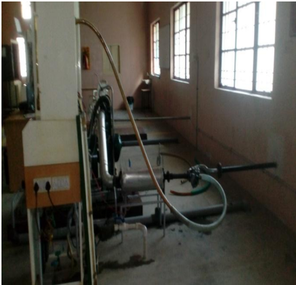
Figure2: Engine Setup