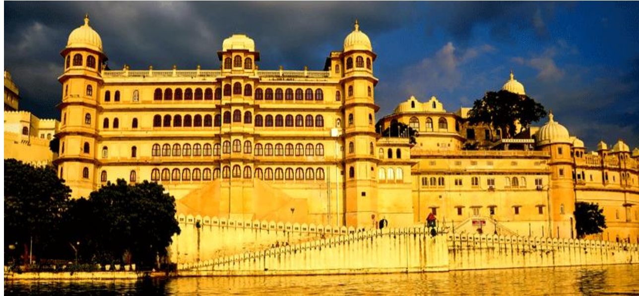
Fig.-3: Typical View of City Palace of Udaipur

It is the historic capital of the kingdom of Mewar in the former Rajputana Agency. Udaipur was founded in 1553 by Maharna Uda Singh II as the final capital of the erstwhile Mewar Kingdom, located to the south of Nagada on the banks of Banas River. Udaipur is well connected with nearby cities and States by means of road, rail and air transportation facilities, including Maharana Pratap Airport. Udaipur is a very popular tourist destination and known for its history, culture, scenic locations and the Rajput-era palaces and five of the major lakes are namely Fateh Sagar Lake, Pichola Lake, Swaroop Sagar Lake, Rangasagar and Doodh Talai Lake have been included under the restoration project of the National Lake Conservation Plan of the Government of India. Udaipur has a diverse source of economy, with major contributions from tourism, minerals, natural stones and handicraft. Udaipur hosts several state and regional public offices, including offices of Director of Mines and Geology, Commissioner of Tribal Area Development, Agriculture University, Indian Institute of Management, Centre of Excellence for Tourism Training, Commissioner of Excise, Hindustan Zinc Limited and Rajasthan State Mines and Mineral Corporation Limited. Udaipur is raising as Educational Hub as well, with 5 Universities, 14 Colleges and more than 160 High Schools.