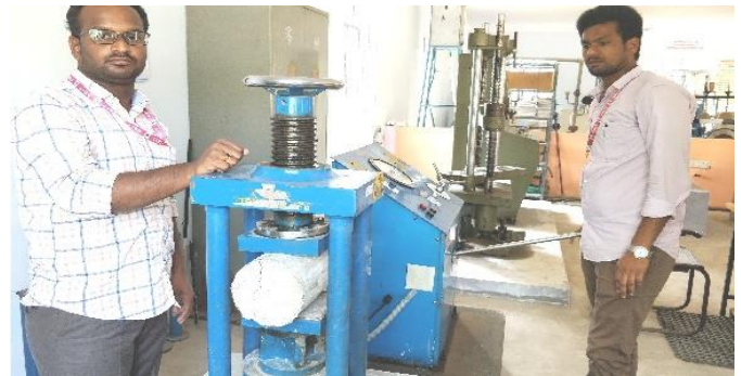
Fig 3: Shows split tensile strength test for cylinders

not normal to resist the direct tension. The concrete establish cracks when subjected to tensile forces.