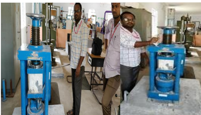
Fig 2: Shows compressive strength test for cubes

The compressive strength of any material is characterized as the resistance to failure down the activity of compressive forces. Especially for concrete, compressive strength is a crucial parameter to determine the performance of the material during service conditions. Concrete mix can be graceful to obtain the required engineering and durability equity. Some of the other engineering properties of seasoned concrete carry Creep coefficients, Elastic Modulus, Tensile Strength, density, coefficient of thermal expansion etc.