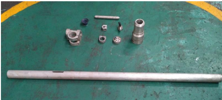
Various parts of gripper

1) Swivel Arm - The swivel arm is the part which allows for unlimited positioning of the suction cup.