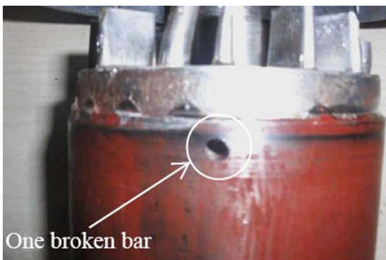
Fig. a) Rotor Fault (broken bar)

Rotor faults are nothing but the asymmetries in the rotor due to technological difficulties or melting of bars and end rings. The asymmetry in the rotor cage results in the asymmetrical distribution of the rotor currents. Because of which, damage of one rotor bar can cause damage of the surrounding bars and thus damage can spread, which results into multiple bar fractures. In case of a crack in bars, the cracked bar will overheat because of which bar may break. Thus, the surrounding bar will carry higher currents and are subjected to larger thermal and mechanical stress and may start to crack.