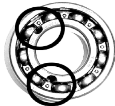
Fig. c) Bearing Fault

Bearing are used to provide the rotary motion to the shafts. A continued stress on the bearings causes fatigue failures. Small pieces break loose from the bearings which result in rough running of the bearings. It generates detectable vibrations and increased noise level. High temperature at bearing is also one of the reason for bearing faults.