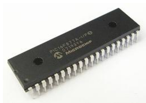
Fig-3: PIC Controller (16F877A)

The control signal by the MATLAB is given to the controller. The RS 232 is used for interfacing between computer and controller. The controller gives the signal to motor driver IC L293D which is 16 pin IC. It consists of a set of two DC motors simultaneously in left and right direction.