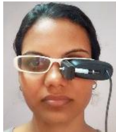
Fig-2: Web cam mounted with goggle

A further decision is based on the MATLAB & PIC Microcontroller (16F877A). Programming is done on the controller. The first part is to detect the eye movement & second part is of motor drive section.