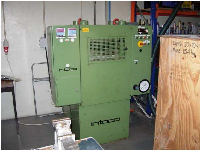
Fig. -2 :- Hydraulic press

The specimens were carried out at different speed of revolution under cyclic loads. During testing thermocouples were placed at various points on the surface on the surface of the specimens in order to investigate thermal effects. The specimens were tested for each load level.