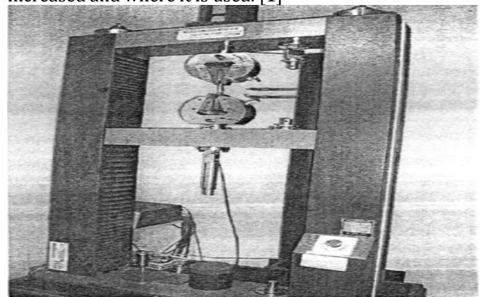
Fig. -2 :- Universal Testing machine

The single lap joint specimens were tensile tested in a universal testing machine. The specimen were tested under a head displacement rate of variable mm per minute is depends on the room temperature. The universal testing machine is specimen is hold between two balls and gradually load is applied and to investigate the specimen is strength is increased and where it is used. [1]