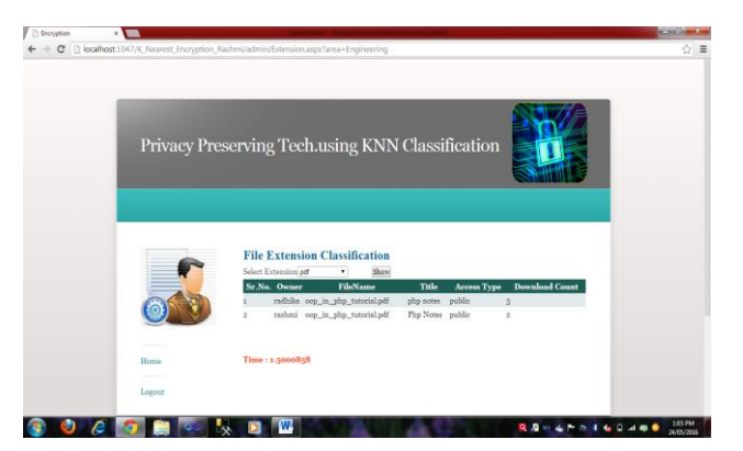
Fig.2 classification of engineering field using using PPDM