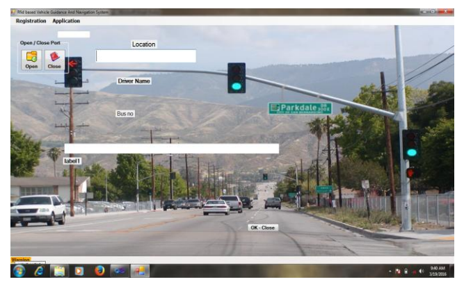
Fig.6: When the close port button is clicked, the initial stage of project will appear.