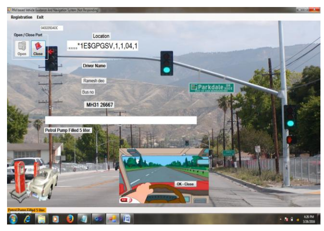
Fig.5: GPS values are shown on the label named as Location and exact location value is shown on the label placed exactly above the open/close port.