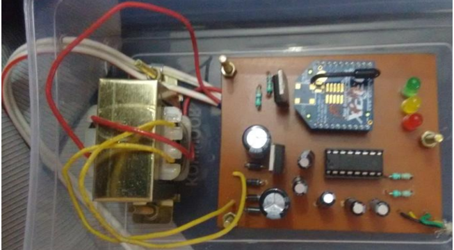
Fig 2 : Receiver

This module includes some subcomponents such as: RFID module(receiver) which is used to receive data from Zigbee RFID transmitter at bus to receiver at server side.