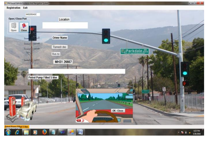
Fig.5: With the use of RFID values, the user can see the information of bus and driver of the bus.