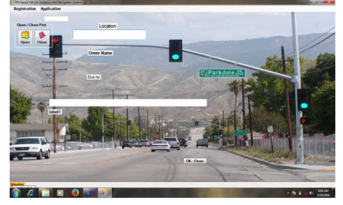
Fig.3: User Interface