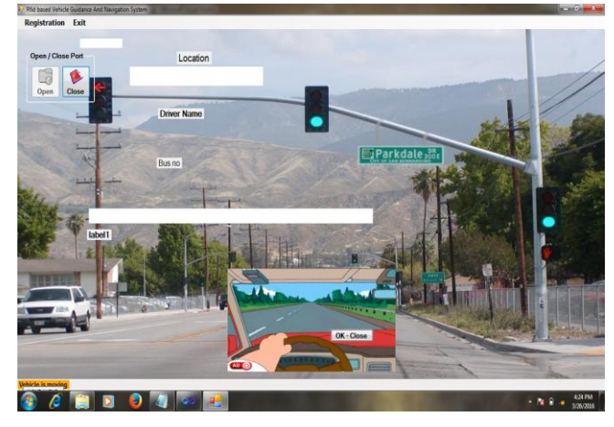
Fig.4: When the open port button is clicked, the user can see that vehicle is moving or not.