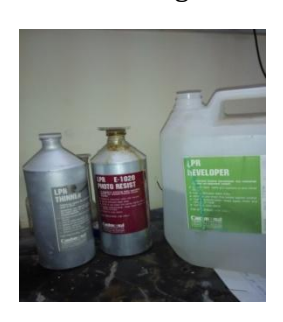
c) Photoresist Solution