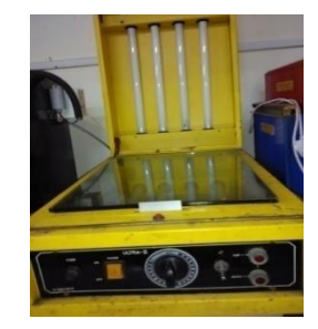
d) UV Exposure Unit