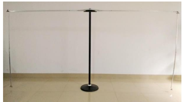
Fig 7. Full size (12 feet x 6 feet)