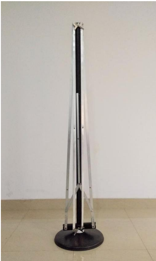
Fig 6. Folded state for packing and transport

A prototype is made and its different configurations are shown below: