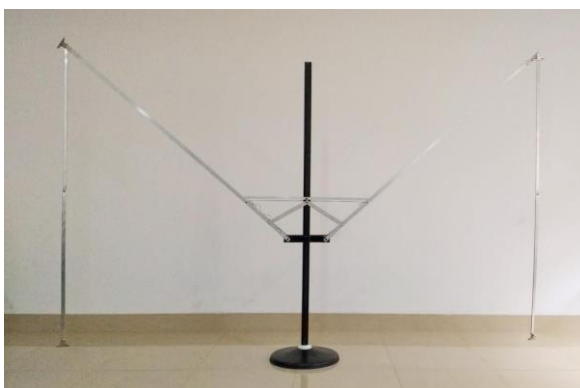
Fig 7. Intermediate size