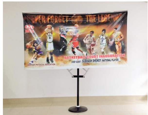
Fig 8. Display stand with a 8 feet x 4 feet flex