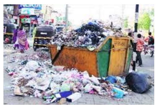
Fig -1: Conditions in the city

All the above disadvantages are a result of lack of real time information resulting in unsuccessful collection of waste. The Pune Municipal itself finds this as a big problem and a big hurdle in between Pune's Smart City [3] initiative. There is an urgent need to optimize the management of this service to reduce infrastructure, operating and maintenance costs, as well as reduce contamination directly associated with waste collection.