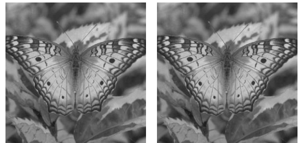
Fig. 3 Original and HR image of Butterfly