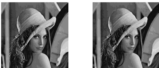
Fig.2 Original and HR Lena image

For each standard filter above parameters are calculated and results are shown in table 1, table 2, table 3 and table 4 with images real time image (job), Lena, Butterfly, Pirate and Elaine image respectively. The corresponding images which are used for experimentation are shown in figure2, figure3, figure4 and figure5.