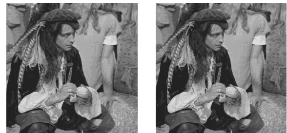
Fig. 4 Original and HR image of Pirate