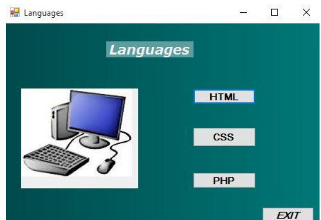
Fig -2: Language Choosing Window

After getting this window you have to select whatever you want. You need html or css or php. After this window the main work of our application is start. The working of this application is so easy that it is not necessary to learn the program. It is very user friendly and runs on any configuration. The main window having many operations and according to the user choice they can select their choice.