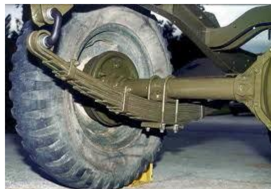
Fig-2 Steel Leaf Spring used in Vehicles (e.g. used in trucks)