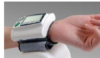
Fig 2: Blood Pressure Sensor

For this project, the transmission is used on the finger to obtain the signal. A light-to-voltage optical sensor, TSL250RLF is select to measure the light transmitted through the finger. A linear regression is determined and systolic BP is estimated from that relationship.