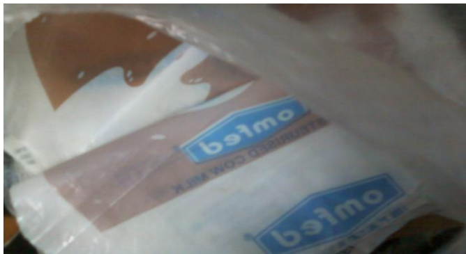
Figure 1- Waste Polythene

water pouches and other packing goods collected from the mixed plastics wastes along the road side, figure. 1.