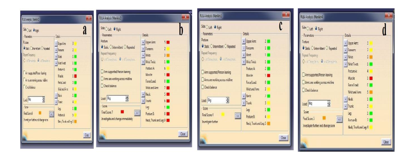
Fig-03: RULA score of an Modelled postures operator (a) Posture 1 (b) Posture 2 (c) Posture 3 (d) Posture 4.

Fig. 1 shows four postures attained by the operator at actual working at fettling department for finishing the disc using grinder.