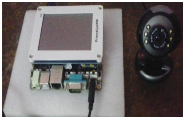
Fig2. MINI 2440 development board

UART, 32-channel DMA, 5-channel 32bit Timers with 2PWM output, General Purpose I/O Ports, I2S-Bus interface, I2C-BUS interface, USB Host, USB OTG Device operating at high speed (480Mbps), 3-channel SD/MMC Host Controller and PLLs for clock generation.