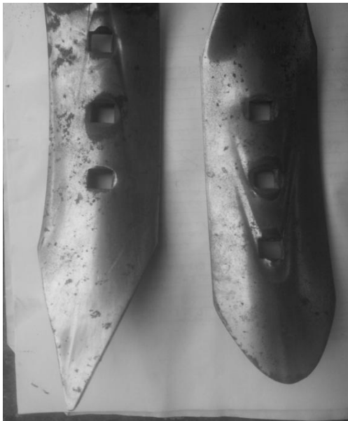
Fig-2: A new and a worn out ploughshare parts

existing material by addition of any wear resistance alloying element etc.