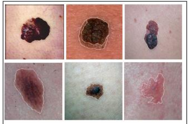
Fig.3 Ground truth for skin cancer m1 to m6

the reality that the crossing point between the disease and healthy skin is very uncertainty and this ready to complex to suggestion accurately the delineate of the skin cancer.