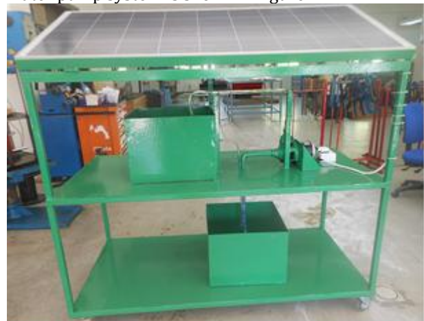
Fig.1.Assembly of solar water pump system

A different part of solar water pump system has been made and then assembled together. An assembly of solar water pump system is shown in figure 1.