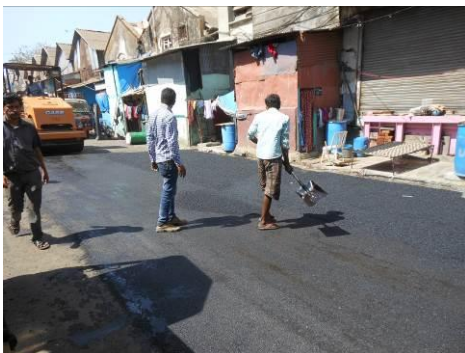
Fig.2: Uneven Paving of Surface coarse by Paver Machine