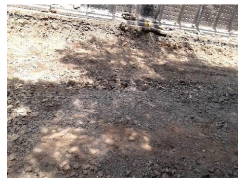
Fig.4: Improper levelling (dressing) at the subgrade layer