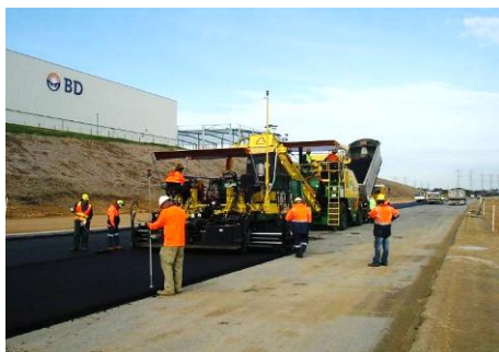
Fig.6: Laser based system used for road construction in Asphalt paver machine used in developed countries