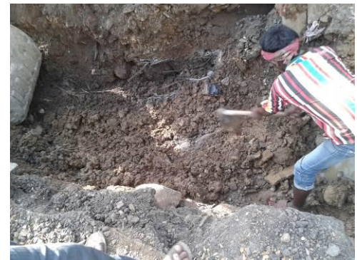
Fig.3: Wirelines/Electricity cables cut off due to improper excavation by Backhoe Loader (JCB)