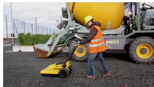
Fig.8: Ground Penetrating Radar System (GPRS)