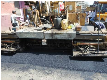
Fig.1: Unchecked Asphalt Paver Machine