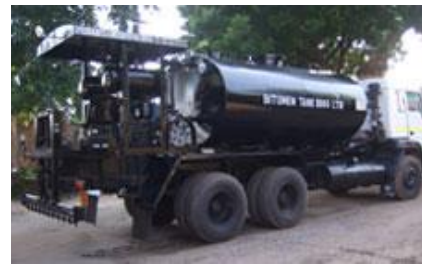
Fig.7: Bitumen Pressure Distributor