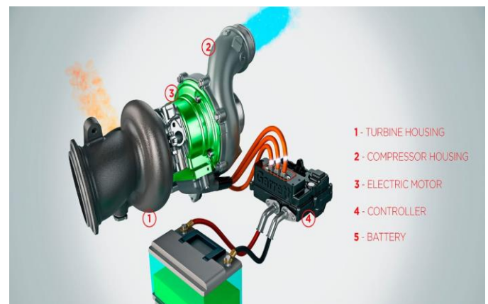
Fig:1 Hybrid turbocharger

By utilizing the rotational energy from the turbocharger, this system creates a sustainable method for powering navigation lights without requiring additional fuel or energy sources. The process optimizes energy efficiency by repurposing otherwise wasted energy, contributing to reduced fuel consumption, lower emissions, and a more sustainable maritime operation.