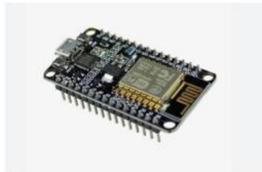
Fig 2. NodeMCU ESP8266

The NodeMCU ESP8266 is a low-cost microcontroller with built-in Wi-Fi used as the main control unit of the system. It processes inputs from sensors/modules, controls relays and other devices, and can also enable wireless communication for monitoring or control applications.