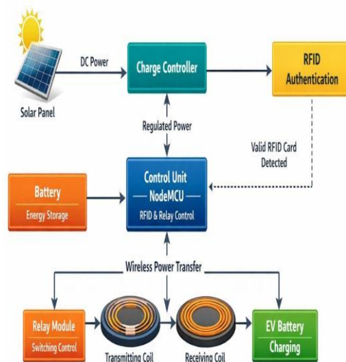
Fig 5. Power flow and control Flow Diagram

The 2-channel relay module is used to switch high-power circuits using low-power control signals from the microcontroller. In this system, it controls the power supply to different sections such as the wireless charging unit, ensuring safe and controlled operation.