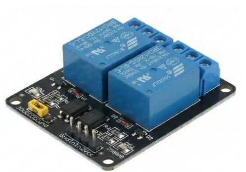
Fig 4. Wireless Power Transfer Unit

The RFID authentication unit is used to provide secure and controlled access to the charging station. Each authorized user is provided with an RFID card or tag. In this system, a commonly used RFID reader module such as MFRC522 is employed, which operates at a supply voltage of 3.3 V and typically consumes around 20 to 30 mA of current during operation.