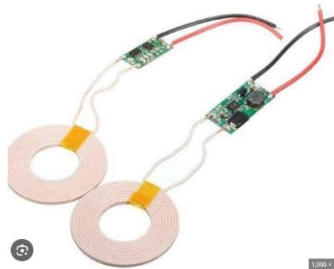
Fig 4. 2-channel relay module

The 2-channel relay module is used to switch high-power circuits using low-power control signals from the microcontroller. In this system, it controls the power supply to different sections such as the wireless charging unit, ensuring safe and controlled operation.