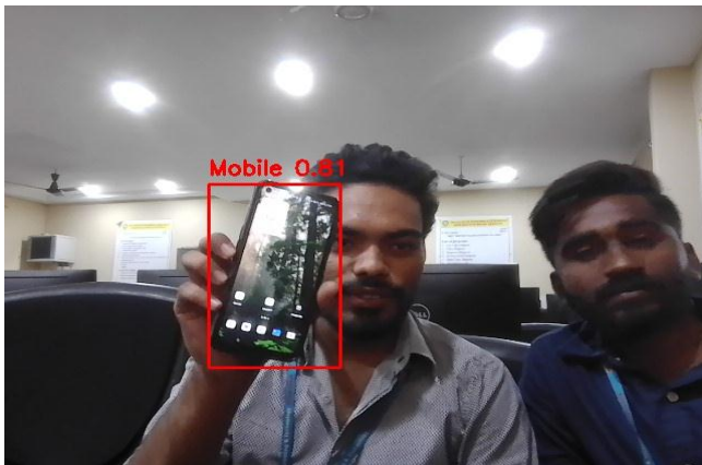
Fig. 2 Mobile Phone Detection using YOLO with Confidence Score