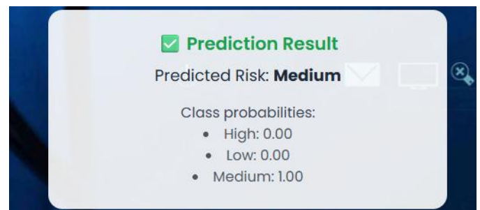
Fig-4.2: Heart Attack Risk Prediction Output (XG Boost Fusion Model)

Figure 4.2 shows the heart attack risk prediction module interface. The sample inputs were processed successfully, and the model predicted the risk level as Medium Risk. This confirms that the integrated model is able to analyze clinical data and generate meaningful risk assessment results that can assist users in preventive healthcare planning.