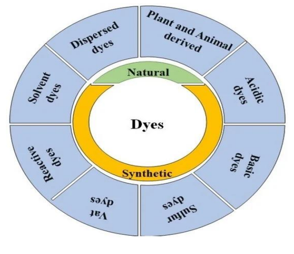
FIG 2. TYPES OF DYES

The environmental impact of dyes, particularly synthetic dyes used in the textile industry, is significant and multifaceted, affecting both ecosystems and human health. Dyes are released into water bodies through the discharge of untreated or poorly treated industrial effluents Water quality is harmed by this pollution, which also raises COD and BOD levels and hinders aquatic plants' ability to photosynthesise. Dyes can leach into the soil from water, affecting soil quality, plant growth, and the health of terrestrial ecosystems. Workers in dye manufacturing and processing facilities may be exposed to harmful chemicals, leading to health issues such as allergies, skin conditions, and even increased cancer risk. The broader population may also be affected through exposure to contaminated water and food (Imtiazuddin, S. M et. al 2018). The production of dyes, especially synthetic ones, is resourceintensive, requiring significant amounts of water and energy, which contributes to the depletion of these vital resources and increases the carbon footprint of the industry. Efforts to mitigate the environmental impact of dyes include developing and implementing cleaner production technologies, such as water recycling and treatment systems, using natural dyes, and adopting less toxic synthetic dyes.