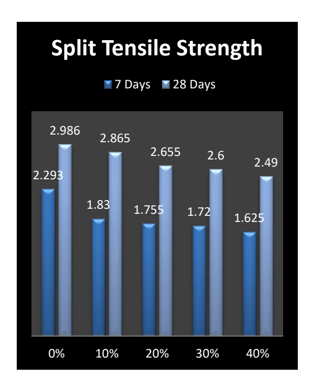
Fig 2 Comparison of strength for 7&28 days