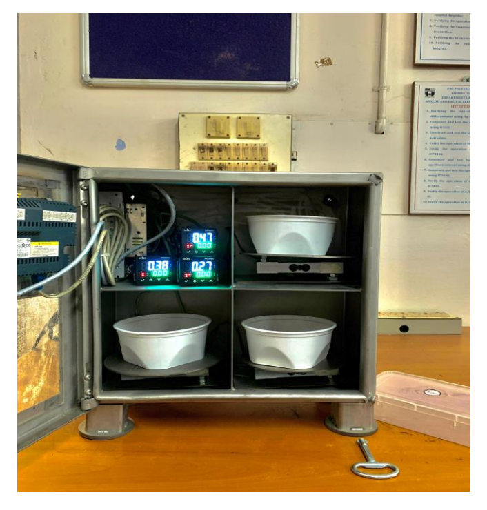
Fig.7.1 Working of controller

An intelligent inventory management system keeps track of stock using tools like load cells, a user-friendly touchscreen interface known as HMI SCU, and a PID500-U Controller. The PID500-U Controller ensures optimal inventory management through precise control and maintaining inventory conditions at optimal levels. Load cells act like precise scales, accurately measuring the amount of product in stock. With the HMI SCU screen, users can easily check and manage inventory. This system ensures efficient inventory management, making it simpler to maintain optimal stock levels and reduce time.