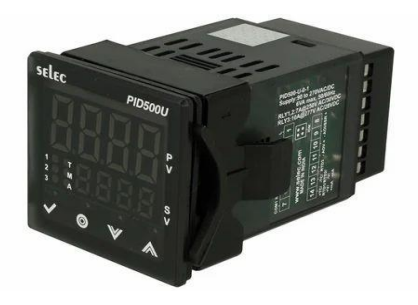
Fig.2.1 PID500-U Controller