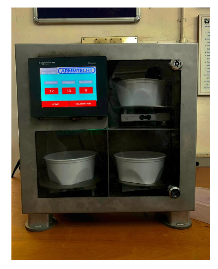
Fig.7.2 Working of project