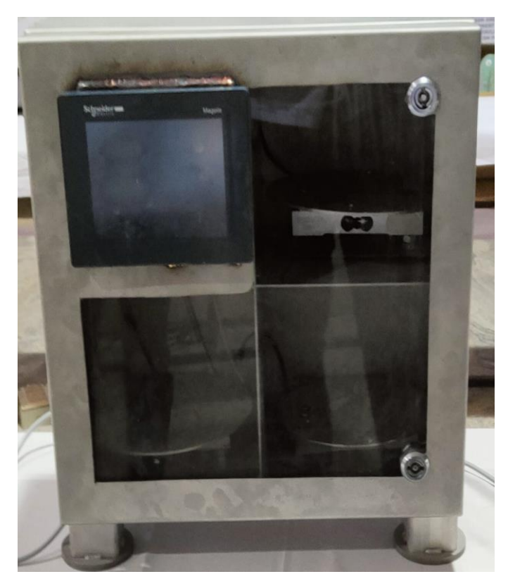
Fig.6.1 Hardware model