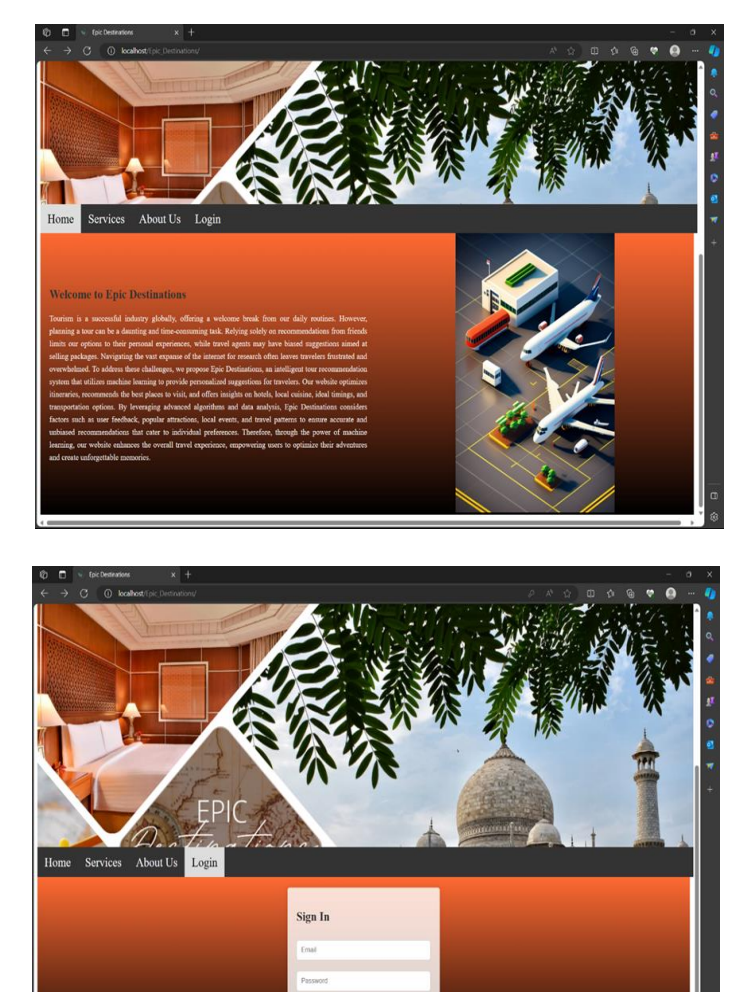
Fig -2: Home Page and Login of Recommendation System

screenshots will help you see how well our project works and what it looks like for users. Below, you'll find the pictures that show how the project is doing and what it looks like for users.