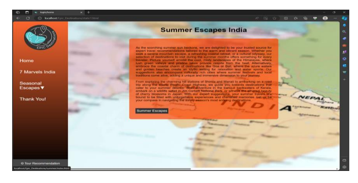
Fig. 3. Select a Category for Tour Recommendation