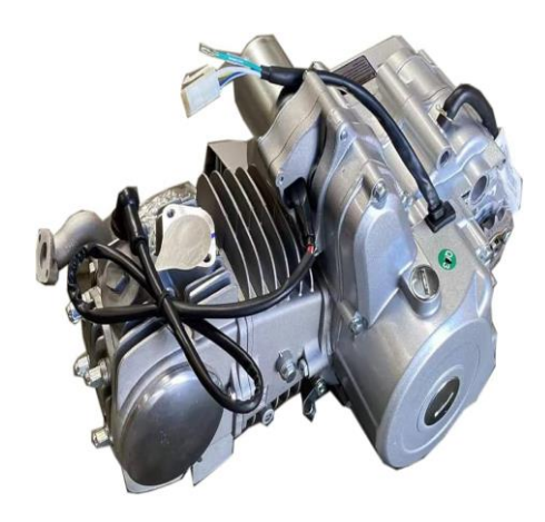
Fig-1: 125cc Engine

at low RPMs, enabling efficient performance in challenging conditions such as mud, sand, or steep inclines. Additionally, they often incorporate features like air-cooling or liquid-cooling to maintain optimal operating temperatures during intense use. Overall, petrol engines in ATVs are integral components that provide the necessary power and reliability for off-road