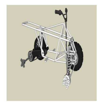
Fig-4 Metal Chassis

(d) Chassis:- An all-terrain vehicle (ATV) chassis is the structural framework that supports all other components of the ATV, including the engine, suspension, steering, and bodywork. Typically made from steel or aluminum, the chassis is designed to withstand rugged terrain and provide stability and durability during off-road adventures. It forms the backbone of the ATV, dictating its overall strength, weight distribution, and handling characteristics. ATV chassis designs can vary widely depending on the intended use, with some optimized for racing performance while others prioritize utility and versatility for recreational or work purposes.