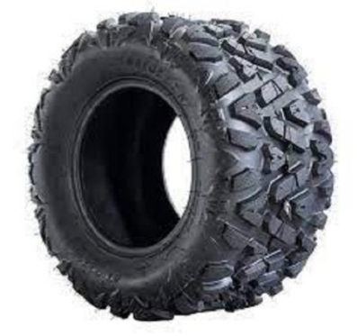
Fig -2:Offroad tyres

(c) Suspension: ATV (All-Terrain Vehicle) suspension systems are crucial for providing stability, control, and comfort across varied terrain. Typically, they consist of shocks, springs, and other components that absorb impacts and vibrations. The suspension adjusts to terrain changes, ensuring optimal traction and handling. Different ATV models may feature variations in suspension design, including independent suspension for each wheel or solid axles. Modern advancements incorporate technologies like adjustable damping and electronic controls enhance performance and to adaptability to different riding conditions. Ultimately, an effective ATV suspension system enhances rider safety and enjoyment by smoothing out rough terrain and maintaining stability.