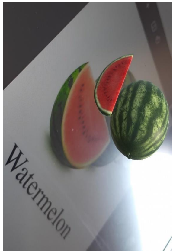
Fig. AR Image

The "LEARN" section within the KidoLearn app offers an enriching educational experience for children, covering a diverse range of subjects and topics. From exploring the fascinating world of fruits and animals to delving into the realm of numbers, days, months, helpers, and seasons, this section provides interactive learning opportunities designed to engage young learners. Through vibrant visuals, engaging activities, and informative content, children can embark on an educational journey that sparks curiosity and fosters a deeper understanding of the world around them. Whether they're discovering the characteristics of different fruits, identifying animals and their habitats, or learning about the days of the week and months of the year, the "LEARN" section offers a comprehensive platform for holistic learning and exploration.