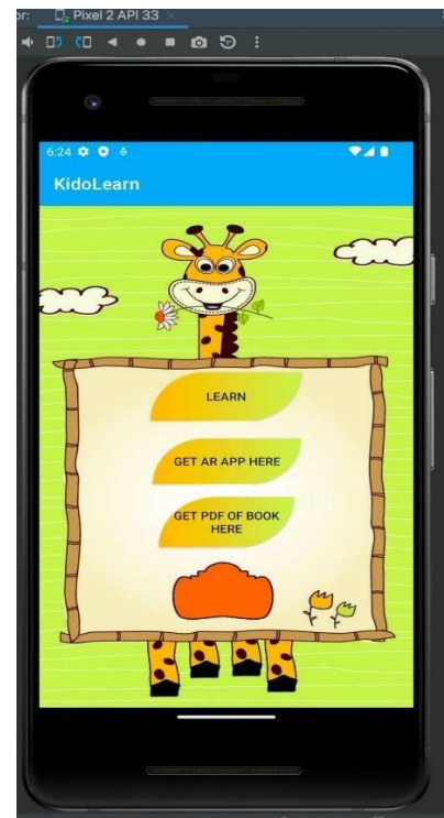
Fig. Home Page

KidoLearn, the innovative kids' learning app utilizing augmented reality (AR), features three primary buttons to enhance children's educational experience. The "LEARN" button provides access to a diverse array of interactive learning sections tailored to cater to different subjects and topics. These sections offer engaging content and activities, fostering curiosity and knowledge acquisition among young learners. Additionally, the "GET AR APP HERE" button enables users to seamlessly download the AR application, allowing them to experience immersive educational content and simulations in real-time. Moreover, the app offers the convenience of accessing supplementary learning materials in PDF format through the "GET PDF OF BOOK HERE" button, providing users with additional resources to support their educational journey.