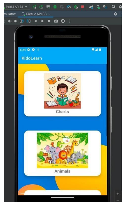
Fig. Learn Section