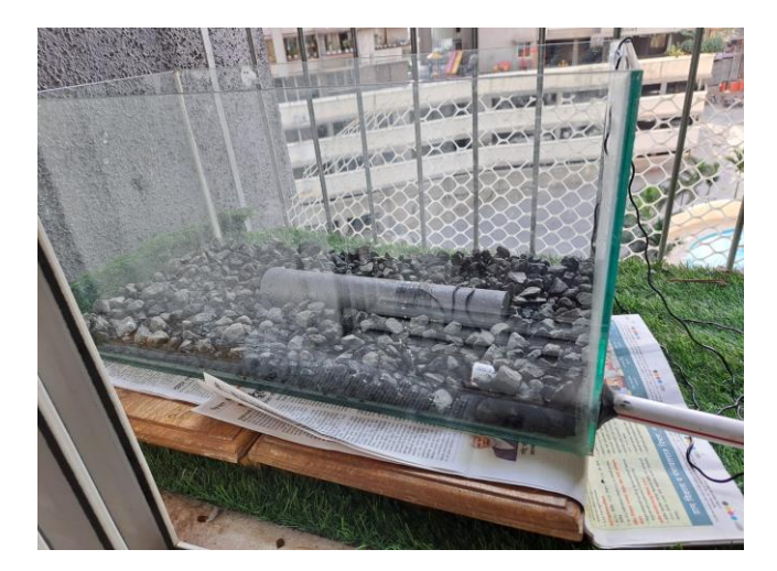
Fig 2 . Layer One