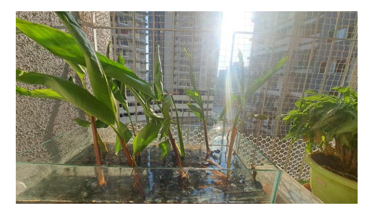
Fig 6 . Constructed Wetland - Microbial Fuel Cells