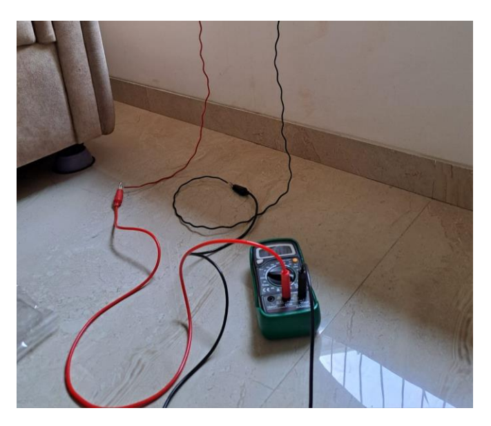
Fig 5. Multimeter