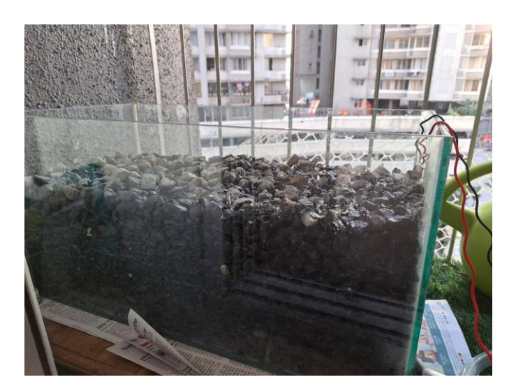
Fig 4 . Layer Three