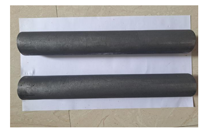
Fig 1. Graphite Rods

Canna indica which is also called as Indian shot, can be used to recycle domestic wastewater by using the roots of it and soil bacteria for domestic re-usage such as for gardening, and flushing of toils.