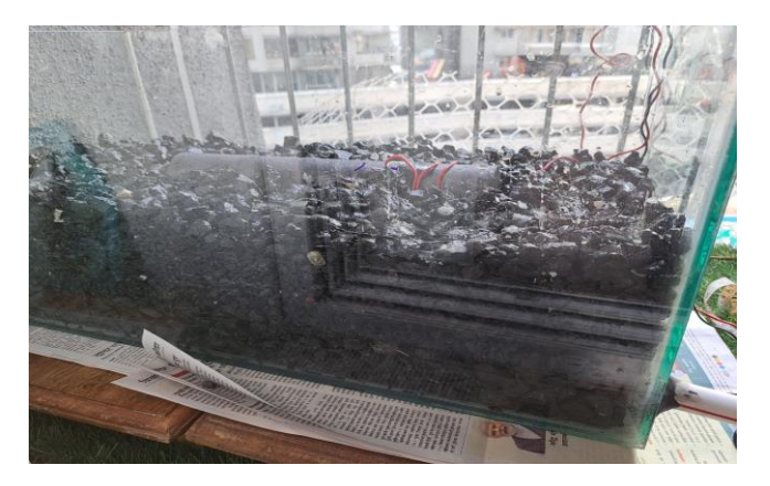
Fig 3 . Layer Two