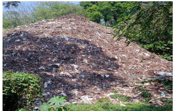
Fig -2: Dump Site, Parakadavu