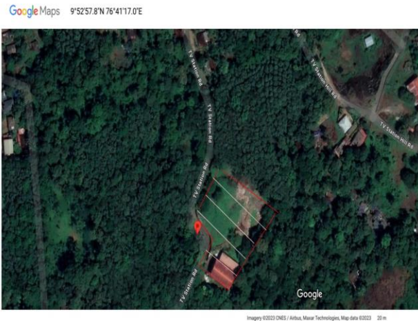
Fig -1: Location of Dumpsite