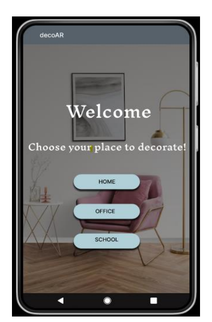
Fig -1:Home Page