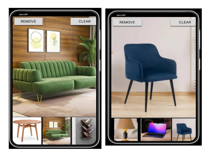
Fig - 2: Actual Representation Using 3D Objects

Created a comprehensive system architecture, outlining how Bootstrap, HTML, CSS, JavaScript, PHP, and MySQL will work together.