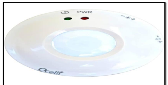
Fig 3 Motion sensor