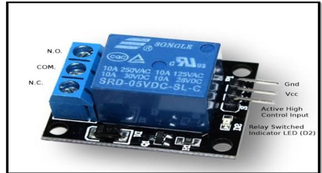
Fig 5 Relay module

on the same electromagnetic principles; however, DC relays require a DC power source, whereas AC relays require an AC power source