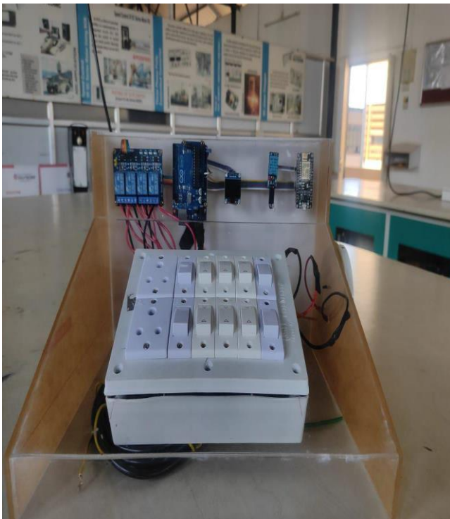
Fig 6 actual image