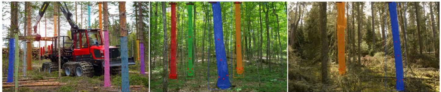
Fig. 4: Predictions on real images from ResNeXt-101 trained only on synthetic images. We observe that even with the reality gap, the model can still detect trees with high precision, but suffers from low recall rates.

Table III appears that including the veil department reliably makes strides AP bb and AP kp . Comparatively, including the keypoint department diminishes AP bb and AP mask . These discoveries adjust with [2], as they found that the keypoint department benefits from multitask preparing, but it does not offer assistance the other assignments in return. Superior bounding box and keypoint location can happen by learning the highlights particular to division. In reality, a wealthier and point by point understanding of picture substance requires pixel-level division, which can play an imperative part in absolutely delimiting the boundaries of person trees [16].