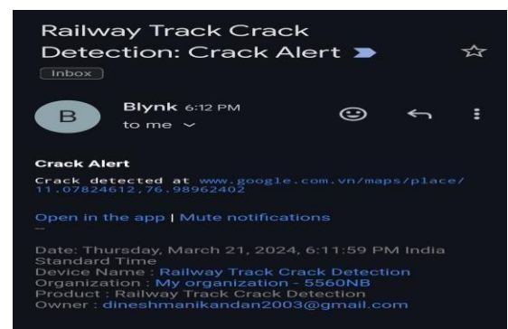
Fig.10. Information Received in the mobile Phone

The taking after figure appears that SMS gotten on cellular phones are interior the latitudinal and longitudinal areas where a crack or impediment is located.