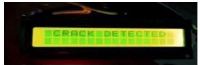
Fig.9. Crack Detected

The "Railroad Track Split Discovery utilizing ESP 32" venture points to distinguish splits on railroad tracks utilizing an ESP 32 microcontroller. The ultrasonic sensor identifies the separate between the sensor and the rail, and any noteworthy variety in this separate demonstrates the nearness of a break on the track. The framework at that point alarms the railroad specialists through a GSM module, giving them with the precise area of the split, so they can take essential measures to repair it and avoid any potential mishaps. The extend has been effective in recognizing splits with tall exactness and has the potential to progress railroad security altogether. • Video show units show pertinent data agreeing to the controller's reaction to the provided circumstances. • The controller makes it easier for the driver to function and grants the motors to move. • The IoT module is at that point turned on, and it transmits the message to closest stations guideline them to perform the suitable activity. • The sensors are turned on and can dependably recognize breaks or other obstacles. • When a split is found, the word "broken" will show up on the Driven show. The consequent patterns suggests the "Crack Detected or impediments found" within the Arduino appear show screen