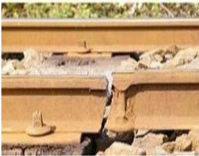
Fig. 1: Crack on track

The main issue was the absence of inexpensive and efficient tools for detecting issues with rail tracks, and of course the absence of regular upkeep of the tracks, which led to the formation of cracks in them, etc. similar issues were caused by antisocial elements that pose a threat to the security of rail travel. This issue has caused several derailments in the past, resulting in many casualties and property. Track cracks were identified as the primary cause of veering off course in the past, but there were no readily accessible, cost-effective automated methods for assessing them. Derailments are one of the leading causes of derailments worldwide. Taking into consideration derailments in general, the United States alone experiences an average of more than one major derailment every three days for more than a decade.