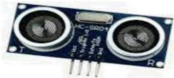
Fig. 6. Ultrasonic Sensor