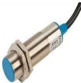
Fig. 7. Proximity Sensor

A proximity sensor is a sensor that detects nearby objects without touching them. Sensing without touching is done with the help of an electromagnetic field. As soon as the object comes within the field, it changes. As there are no mechanical parts or even any physical contact, proximity sensors have high reliability and very long life. Proximity sensors detect the changes in the physical attributes of an object.