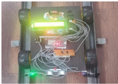
Fig.11. Project Image