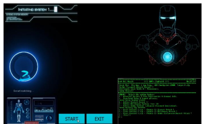
Fig - 4: GUI of J.A.R.V.I.S.

PyQt5 is a powerful library for creating graphical user interfaces in Python. Using PyQt5, a "Jarvis" GUI may be created through a number of stages. Start by using pip to install PyQt5. Using Qt Designer, graphically design the user interface by positioning buttons, labels, and other elements. Save this layout as a.ui file. Utilise pycuic5 to transform the.ui file into a Python script. Connect UI components to functions for interactions in another Python script to create the application's logic