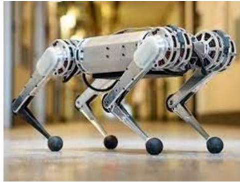
Figure 1.2: mini cheetah

The Mini Cheetah can move in a variety of gaits over various types of hard terrain, and to maintain balance it needs to manage its leg actuators, sensors to detect where its feet should be, and planning algorithms to choose its course and speed.