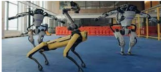
Figure 1.1: Boston Robots

Currently, industrial robots are utilised to transport massive boxes and items in many different fields. Robotic hands and legs are only two examples of the many robots utilised in the medical field. This is great news for persons with disabilities. Robots are essential to the study of physics because they can perform tasks that humans are unable to. We are specifically referring to space robots, which have the ability to live in space, transport supplies for space missions, monitor space stations, or just stroll on the earth so that people may view these locations from a distance. Industrial robots are the most well-known and practical robots. An industrial robot is a versatile manipulator that can be autonomously controlled, reprogrammed, and programmed in three or more axes. These robots can also be customised by users for various uses. Businesses have been able to perform higher-level and more sophisticated jobs by combining these robots with AI, going beyond mere automation.