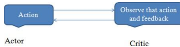
Figure: A2C Working

Advantage The actor-critic algorithm is a value-based algorithm that learns how to choose predictive actions or input actions. It is a policy-based algorithm that covers the mapping of input state to output state. To solve a particular problem in the actor critic algorithm, the actor and critic networks work together. The agent (temporal difference) or prediction error is determined by the advantage function. Learning a hybrid approach (A2C) or a Reinforcement Learning algorithm that combines value optimization with policy optimization techniques. A performer of an action can learn which of their activities are better or worse by receiving feedback on them. Temporal difference learning agents learn by predicting rewards in the future and altering their strategy in reaction to faulty predictions. One of the remarkable things about temporal difference learning is that it appears to be one of the ways the brain picks up new information.