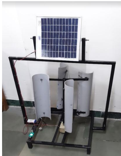
Fig.-Working model of Solar and wind turbine Hybrid system

A device that converts wind energy into electricity is called a wind turbine. The battery charging circuits and then massive utility grids are linked to the generators. In windmills, the air flows across the airfoil area of the blades, creating lift and torque that are both converted into power in the generator. It involves converting wind energy into mechanical energy for the turbine, which is ultimately converted into electricity. The wind turbine's production is erratic and unpredictable since it is reliant on the presence of winds. They may, however, be employed in a big grid alongside traditional generators to lessen the demands placed on those generators while they are generating. The choice is to store power in storage mechanisms like batteries and then discharge it evenly.