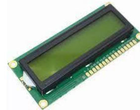
Fig -6 LCD Display

The Arduino microcontroller sends the voltage, current, and temperature values to the LCD display using the LiquidCrystal library. The library provides functions that allow the microcontroller to control the individual segments of the display to display the values.