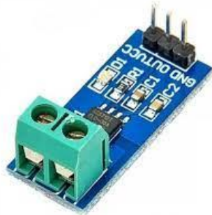
Fig -5: Current sensor

The current sensor is connected to the Arduino microcontroller, which measures the current level and converts it into a digital value. The microcontroller then processes the data and uses it to calculate the battery's state of charge and state of health.