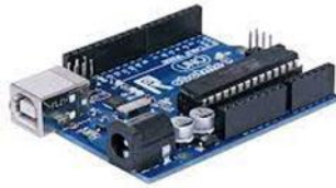
Fig -2: Arduino Uno

The Arduino is integrated with a GSM module, which allows for real-time communication with the vehicle owner or service center. The GSM module sends messages to the registered number if the battery parameters fall below a certain level or the temperature exceeds the limit. This feature ensures that the vehicle owner is informed about the battery status, and appropriate measures can be taken to avoid any potential problems.