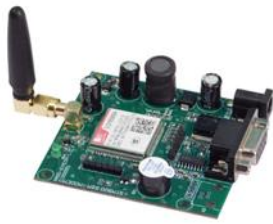
Fig -4: GSM