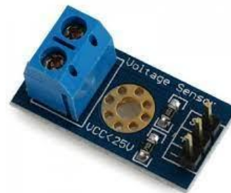
Fig -3: Voltage sensor

The voltage sensor works by measuring the potential difference between two points in an electrical circuit. In this case, it measures the potential difference between the positive and negative terminals of the battery. The voltage sensor converts this analog signal into a digital signal that can be read by the Arduino.