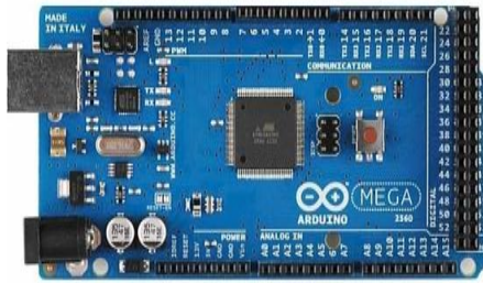
Fig -2: Arduino Mega 2560