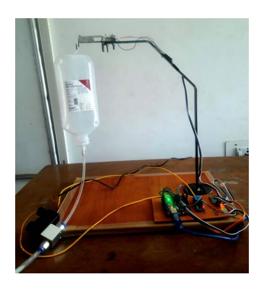
Fig 3 Here IV Bag fluid level is critically low so RED color LED is HIGH and the RELAY MODULE is ON to switch on the solenoid valve to stop the fluid flow