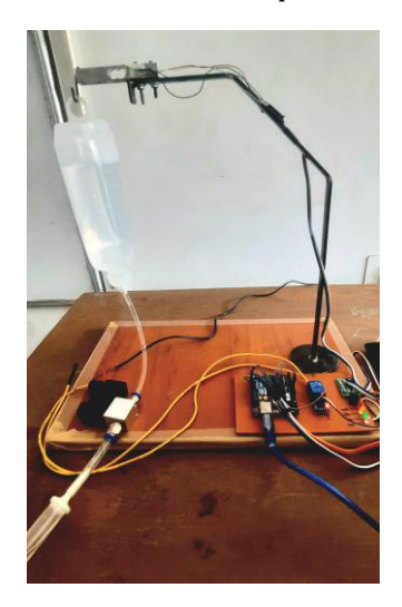
Fig 4 Here IV Bag fluid level is maximum (75%) so GREEN color LED is HIGH.