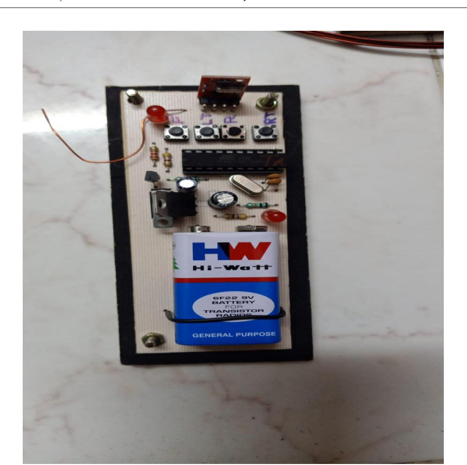
Remote Control Unit

Volume: 10 Issue: 02 | Feb 2023 www.irjet.net p-ISSN: 2395-0072