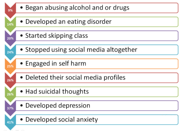
Fig -3: Effects of cyberbullying in kids

A large number of online social media users, including students of various educational institutions in Bangladesh, are victims of cyberbullying. According to data, 49 percent of school children in the country are victims of regular cyber bullying. According to the Ministry of Posts and Telecommunications, three-fourths of women in the country are victims of cyberbullying. However, this issue remains unaddressed. Only 28 percent reported harassment online. Others fear that they will be socially stigmatized if they complain. In addition to cyberbullying, this type of harassment is often happening on mobile phones, e-mails or mobile banking. As a result, depression, inattention to studies and insomnia etc. develop among the victims including women. Even suicides are happening. Children who are victims of cyberbullying are gradually turning to something terrible, the effects of which are devastating and almost irreversible. Below is a statistic showing the percentage of children who are victims of cyberbullying in some cases.