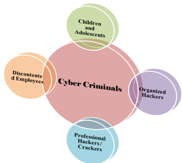
Fig -2: Forms of Cyber Criminals

Cybercriminals are an ever-present threat in every country connected to the Internet. Cyber criminals consist of different groups or categories as shown below: