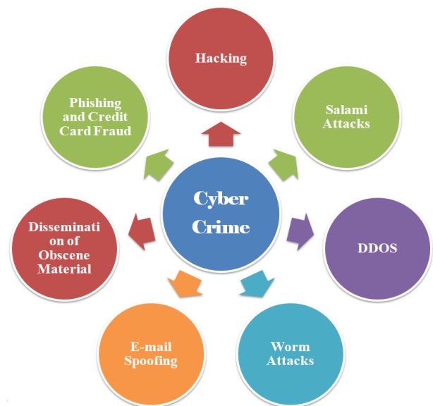
Fig -1: Forms of Cybercrime

Cybercrime has many forms and new forms and techniques are being noticed day by day. However, the main forms of cyber crime are attached below: